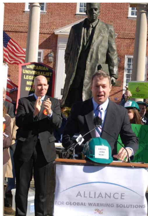
Gov. O'Malley speaks at a Global Warming rally. Check out the two UULM signs in the background!

For a second year, global warming was the focus of UULM-MD's youth advocacy efforts. On February 18, UULM-MD and Greater Washington Interfaith Power and Light sponsored Global Warming Action Day—Interfaith Youth Cool It in Annapolis. Over 30 youth and adults participated, in conjunction with the statewide Environmental Action Day. They discussed why they feel that global warming is a critical issue, heard from elected leaders such as Speaker Mike Busch and Congressman Chris Van Hollen, participated in advocacy training, and most importantly, met with their senators and delegates to express their views.